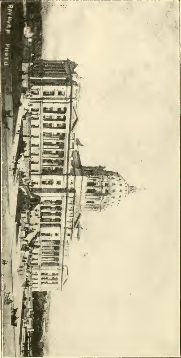
New State Capitol and the Grounds where the Woman's Monument may be erected.