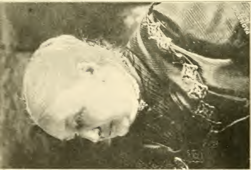
Mrs. Jefferson Davis.