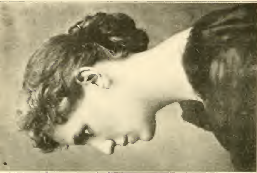
Miss Winnie Davis.